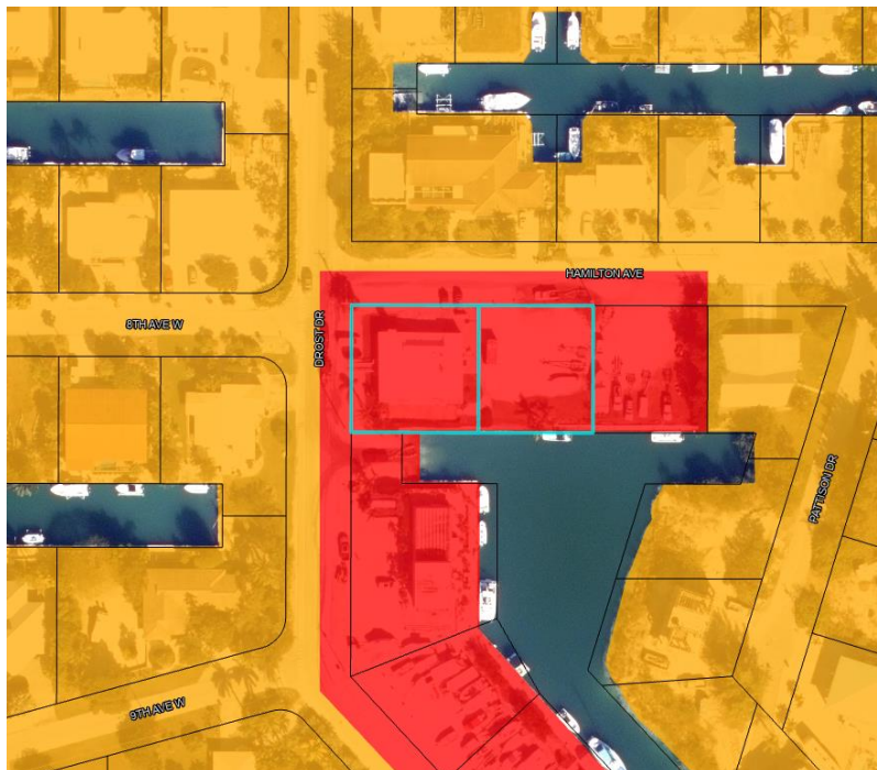
6 7 Subject Property outlined in blue, with Land Use Districts Overlaid (Aerial dated 2022)